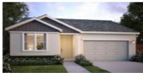
3AR - Craftsman