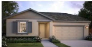
3CR - Napa Valley Classic