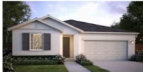
3BR - Contemporary Farmhouse