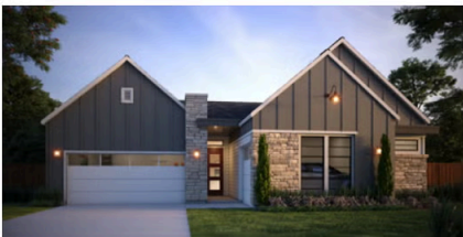
ELEVATION C – MODERN MOUNTAIN