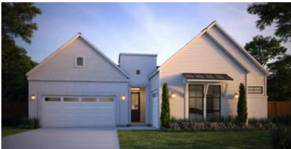
ELEVATION A – MODERN FARMHOUSE