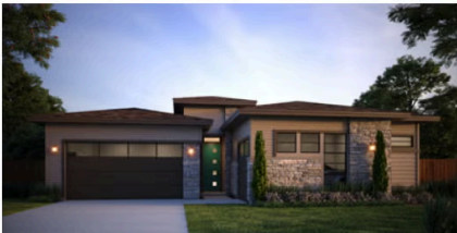
ELEVATION B – MODERN PRAIRIE