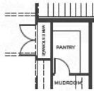
OPTIONAL WINE STORAGE