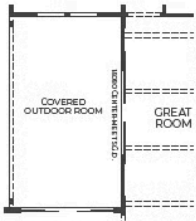
OPTIONAL 18080 CENTER-MEET S.G.D. AT GREAT ROOM