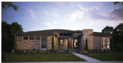
ELEVATION B – MODERN PRAIRIE