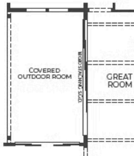
OPTIONAL 18080 STACKING S.G.D. AT GREAT ROOM