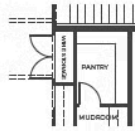
OPTIONAL WINE STORAGE