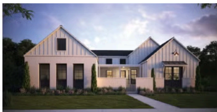
ELEVATION A – MODERN FARMHOUSE