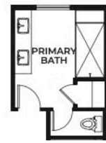
OPT. PRIMARY BATH

Preliminary and subject to change. TRUMARKHOMES