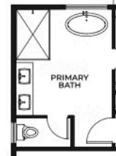
OPT. PRIMARY BATH

Preliminary and subject to change. TRUMARKHOMES