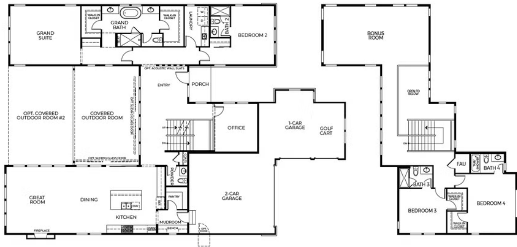
FIRST FLOOR Approx. 2,529 Sq. Ft.