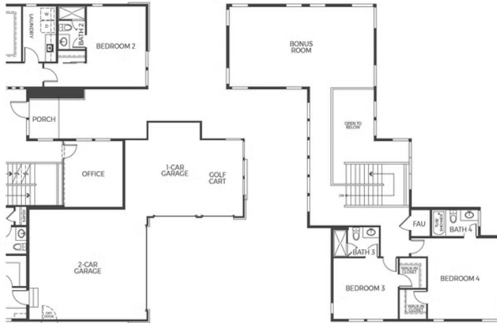
ELEVATION C FIRST FLOOR