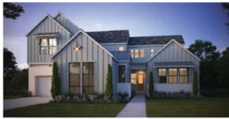
ELEVATION A - MODERN FARMHOUSE