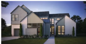
ELEVATION C - MODERN MOUNTAIN