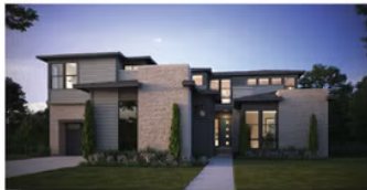
ELEVATION B - MODERN PRAIRIE