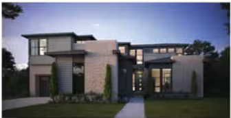
ELEVATION B - MODERN PRAIRIE