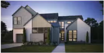
ELEVATION C - MODERN MOUNTAIN