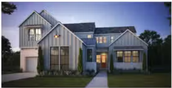
ELEVATION A - MODERN FARMHOUSE