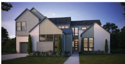
ELEVATION C - MODERN MOUNTAIN