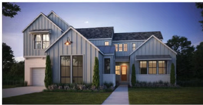
ELEVATION A - MODERN FARMHOUSE