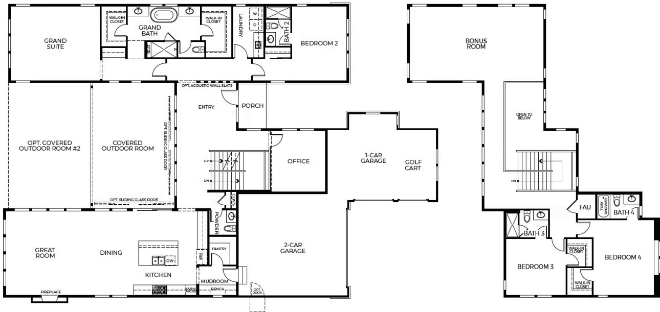
FIRST FLOOR Approx. 2,529 Sq. Ft.