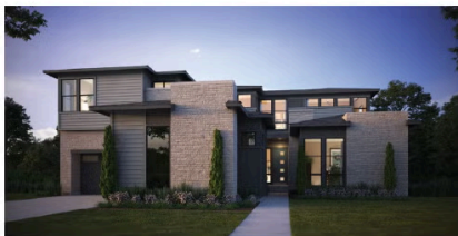
ELEVATION B - MODERN PRAIRIE