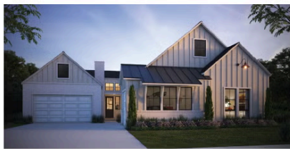
ELEVATION A – MODERN FARMHOUSE