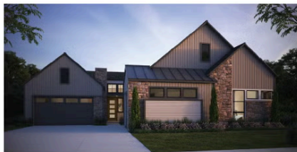
ELEVATION C – MODERN MOUNTAIN