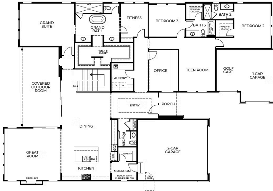
FIRST FLOOR Approx. 3,125 Sq. Ft.