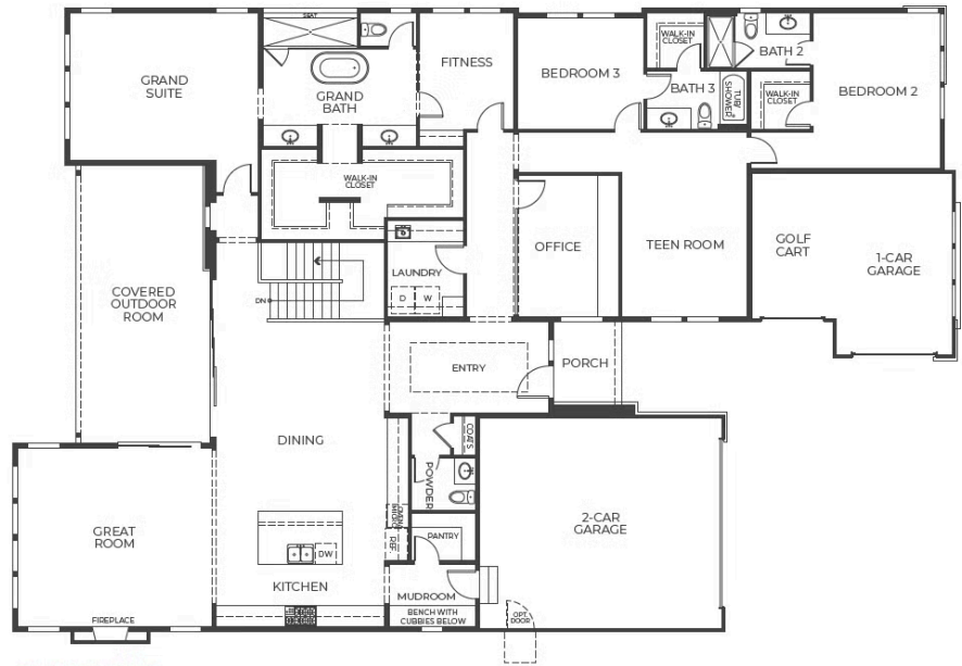
ELEVATION C FIRST FLOOR Approx. 3,125 Sq. Ft.