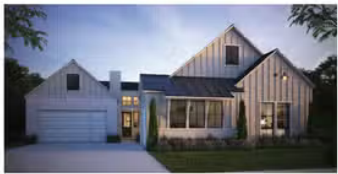
ELEVATION A - MODERN FARMHOUSE