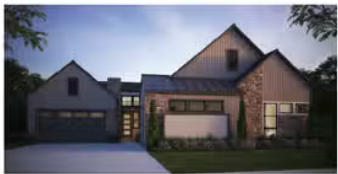
ELEVATION C - MODERN MOUNTAIN