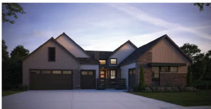
ELEVATION C - MODERN MOUNTAIN