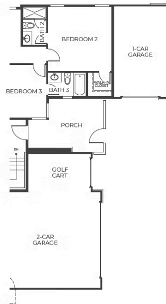
ELEVATION C FIRST FLOOR