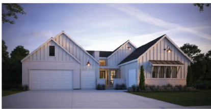
ELEVATION A - MODERN FARMHOUSE