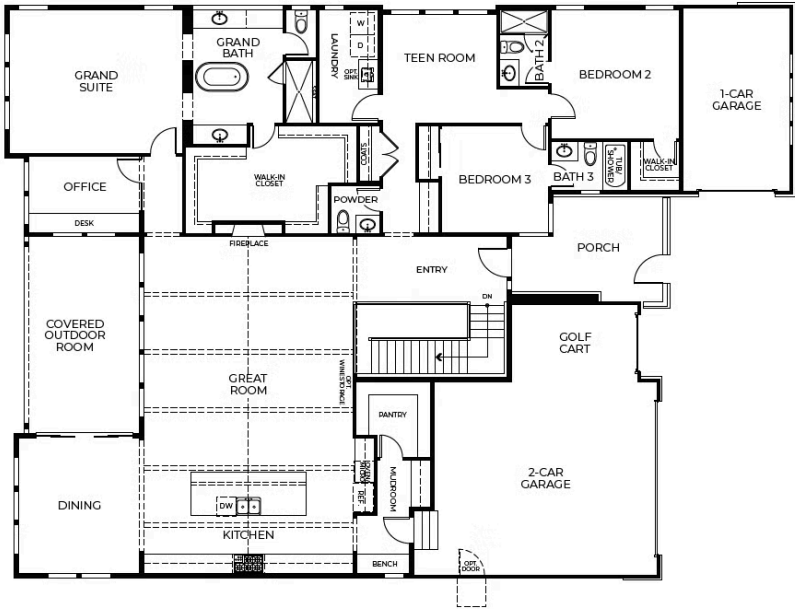
FIRST FLOOR Approx. 3,001 Sq. Ft.