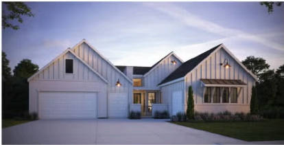
ELEVATION A - MODERN FARMHOUSE