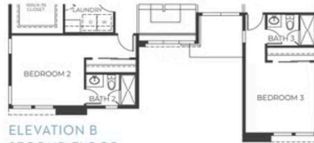
ELEVATION B SECOND FLOOR