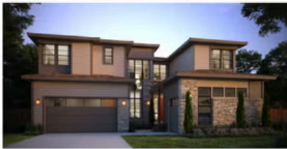
ELEVATION B – MODERN PRAIRIE