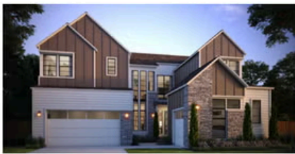
ELEVATION C – MODERN MOUNTAIN