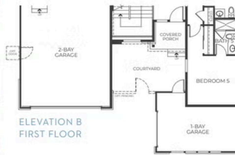
ELEVATION B FIRST FLOOR