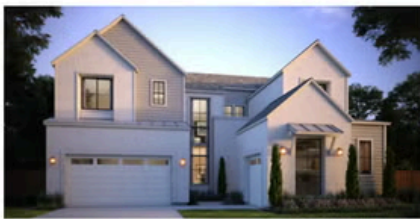
ELEVATION A – MODERN FARMHOUSE