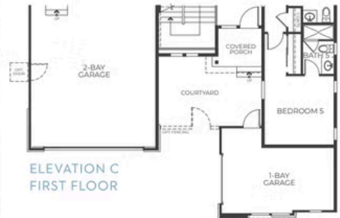
ELEVATION C FIRST FLOOR