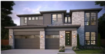
ELEVATION B – MODERN PRAIRIE