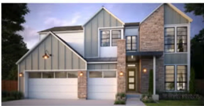
ELEVATION C – MODERN MOUNTAIN