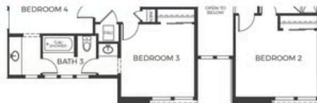
ELEVATION B SECOND FLOOR