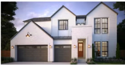
ELEVATION A – MODERN FARMHOUSE