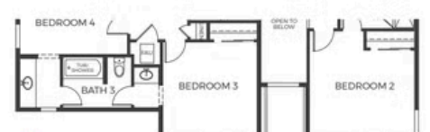
ELEVATION C SECOND FLOOR