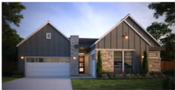
ELEVATION C – MODERN MOUNTAIN