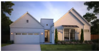
ELEVATION A – MODERN FARMHOUSE