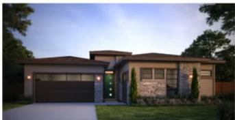
ELEVATION B – MODERN PRAIRIE