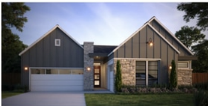
ELEVATION C - MODERN MOUNTAIN