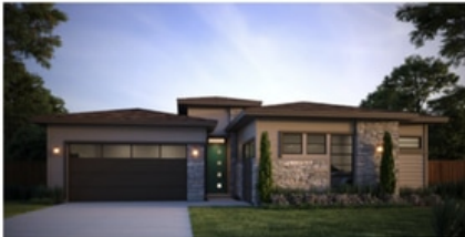
ELEVATION B - MODERN PRAIRIE