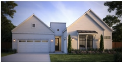
ELEVATION A - MODERN FARMHOUSE