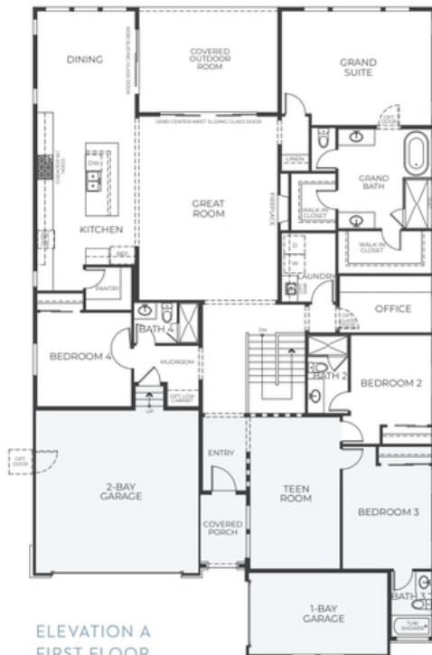
ELEVATION A FIRST FLOOR