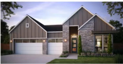
ELEVATION C – MODERN MOUNTAIN