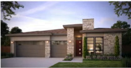
ELEVATION B – MODERN PRAIRIE