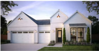
ELEVATION A – MODERN FARMHOUSE