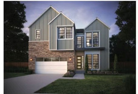
ELEVATION C – MODERN MOUNTAIN

1554 Winter Glow Drive, Windsor, CO 80550 | 970.446.8804 | RainDanceSales@trumarkco.com | VIP-RainDance.com