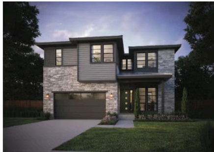
ELEVATION B – MODERN PRAIRIE