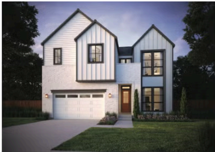
ELEVATION A – MODERN FARMHOUSE

4 – 6 Bedrooms • 3 – 5 Baths • 3-Car Tandem Garage Approx. 2,752 – 3,786 Sq. Ft.