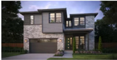
ELEVATION B – MODERN PRAIRIE