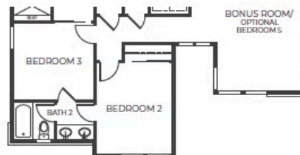
ELEVATION B SECOND FLOOR