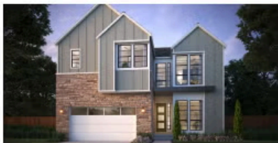
ELEVATION C – MODERN MOUNTAIN