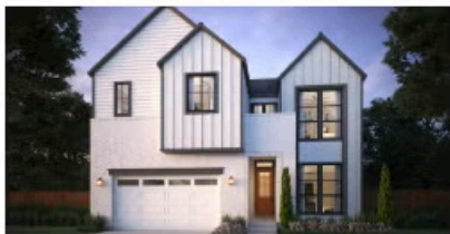
ELEVATION A – MODERN FARMHOUSE