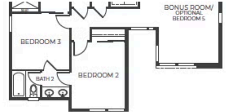
ELEVATION C SECOND FLOOR