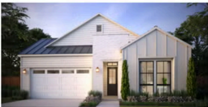
ELEVATION A – MODERN FARMHOUSE