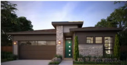
ELEVATION B – MODERN PRAIRIE