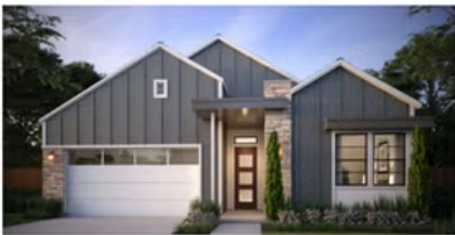
ELEVATION C – MODERN MOUNTAIN