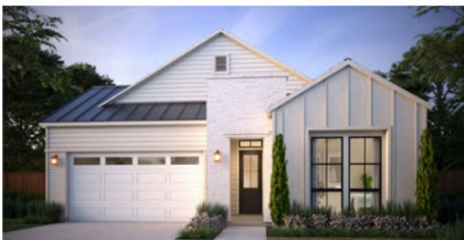
ELEVATION A – MODERN FARMHOUSE