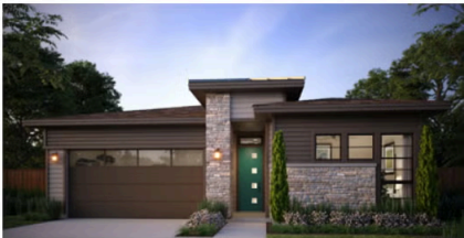
ELEVATION B – MODERN PRAIRIE