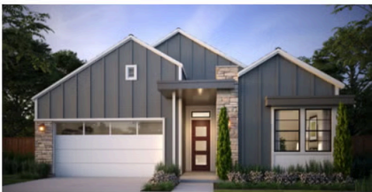
ELEVATION C – MODERN MOUNTAIN