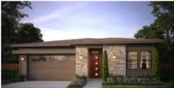
ELEVATION B — MODERN PRAIRIE