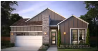
ELEVATION C — MODERN MOUNTAIN