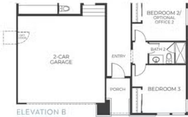
ELEVATION B FIRST FLOOR