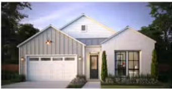
ELEVATION A — MODERN FARMHOUSE