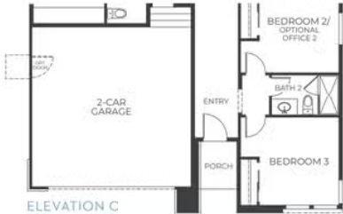
ELEVATION C FIRST FLOOR