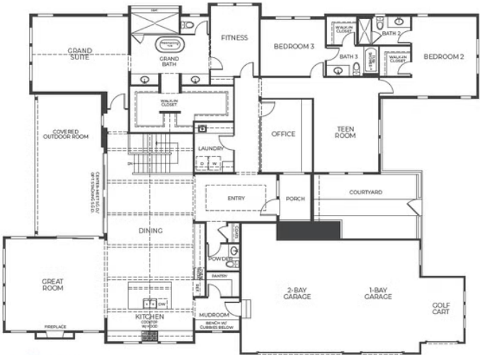
FIRST FLOOR Approx. 3,194 Sq. Ft.