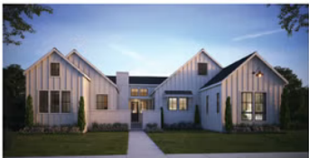
ELEVATION A – MODERN FARMHOUSE