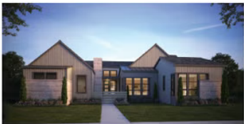
ELEVATION C – MODERN MOUNTAIN