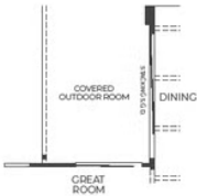
OPTIONAL STACKING S.G.D. AT DINING