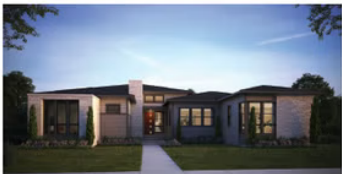
ELEVATION B – MODERN PRAIRIE