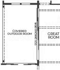
OPTIONAL 180° STACKING S.G.D. AT GREAT ROOM