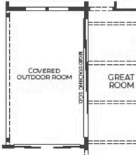
OPTIONAL 180° STACKING S.G.D. AT GREAT ROOM