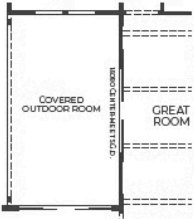
OPTIONAL 180° CENTER-MEET S.G.D. AT GREAT ROOM