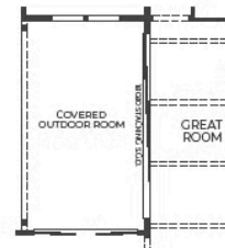
OPTIONAL 18080 STACKING S.G.D. AT GREAT ROOM