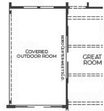
OPTIONAL 18080 CENTER-MEET S.G.D. AT GREAT ROOM