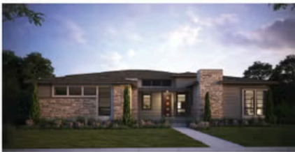
ELEVATION B - MODERN PRAIRIE