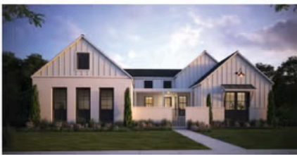
ELEVATION A - MODERN FARMHOUSE