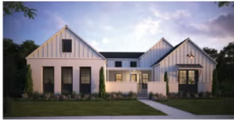
ELEVATION A — MODERN FARMHOUSE