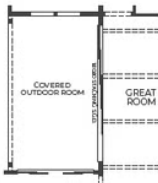
OPTIONAL 18080 STACKING S.G.D. AT GREAT ROOM