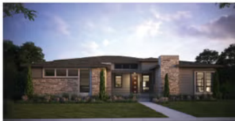
ELEVATION B — MODERN PRAIRIE