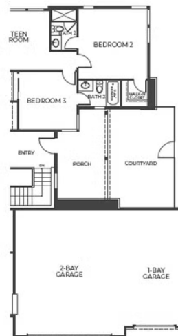
ELEVATION B FIRST FLOOR