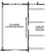
OPTIONAL 18080 CENTER-MEET S.G.D. AT GREAT ROOM