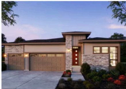
Elevation 2B - Modern Prairie