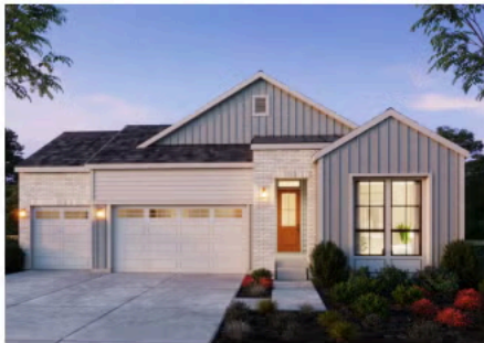
Elevation 2A - Modern Farmhouse