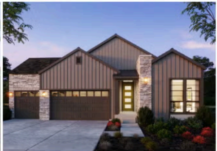
Elevation 2C - Modern Mountain