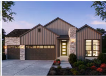
Elevation 2C - Modern Mountain