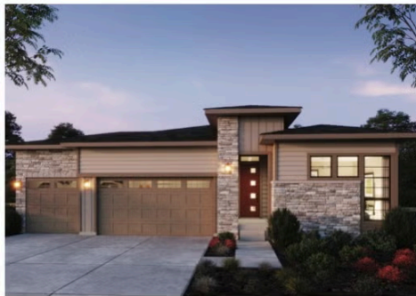
Elevation 2B - Modern Prairie