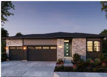
Elevation 1B - Modern Prairie