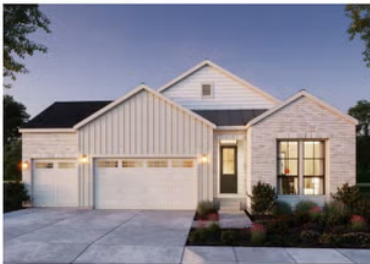
Elevation 1A - Modern Farmhouse