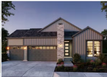
Elevation 1C - Modern Mountain