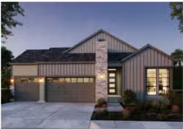
Elevation 1C - Modern Mountain