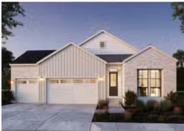
Elevation 1A - Modern Farmhouse