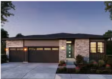
Elevation 1B - Modern Prairie