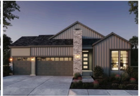
Elevation 1C - Modern Mountain

970.450.5504 | KitcheLakeSales@trumarkco.com | 1432 Alyssa Drive, Timnath, CO 80547 | VIP-KITCHEL.COM