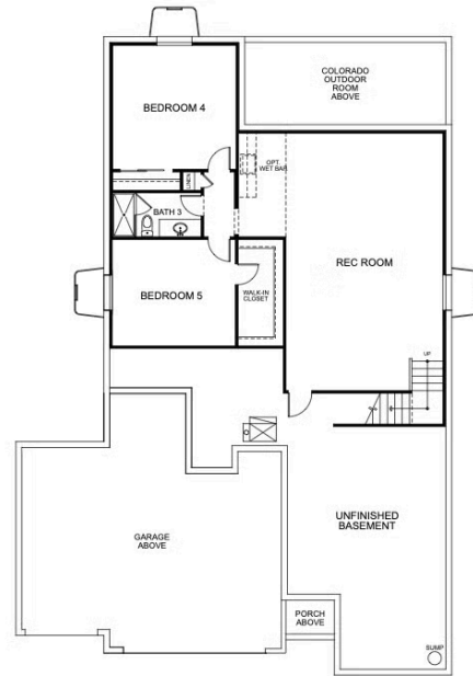
OPTIONAL FINISHED BASEMENT WITH BEDROOM 5

970.450.5504 | KitcheLakeSales@trumarkco.com | 1432 Alyssa Drive, Timnath, CO 80547 | VIP-KITCHEL.COM