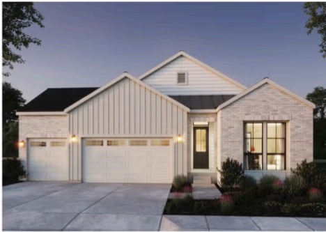
Elevation 1A - Modern Farmhouse

3 – 5 Bedrooms · 2.5 – 3.5 Baths · 3-Car Garage Approx. 2,016 - 3,200 Finished Sq. Ft.