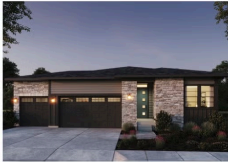
Elevation 1B - Modern Prairie