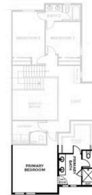
SECOND FLOOR - HIGH COUNTRY RANCH

Preliminary and subject to change. 720.802.6221 | SterlingRanchSales@trumarkco.com | 7046 Watercress Drive, Littleton CO | VIP-STERLINGRANCH.COM