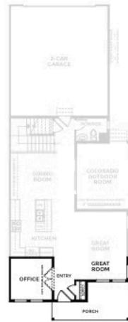
FIRST FLOOR - HIGH COUNTRY RANCH