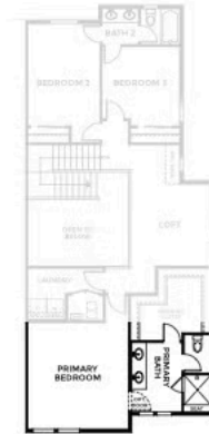
SECOND FLOOR - HIGH COUNTRY RANCH

Preliminary and subject to change. 720.802.6221 | SterlingRanchSales@trumarkco.com | 7046 Watercress Drive, Littleton CO | VIP-STERLINGRANCH.COM