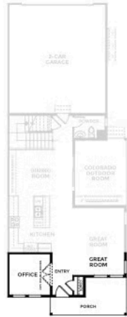
FIRST FLOOR - HIGH COUNTRY RANCH