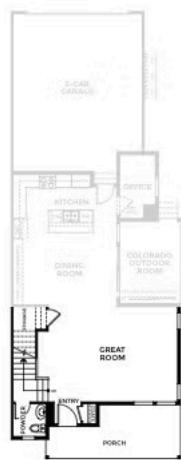
FIRST FLOOR - HIGH COUNTRY RANCH