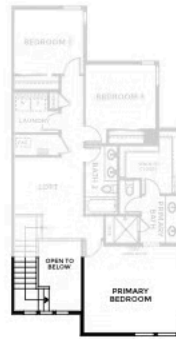
SECOND FLOOR - HIGH COUNTRY RANCH

Preliminary and subject to change. 720.802.6221 | SterlingRanchSales@trumarkco.com | 7046 Watercress Drive, Littleton CO | VIP-STERLINGRANCH.COM