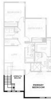
SECOND FLOOR - HIGH COUNTRY RANCH

Preliminary and subject to change. 720.802.6221 | SterlingRanchSales@trumarkco.com | 7046 Watercress Drive, Littleton CO | VIP-STERLINGRANCH.COM