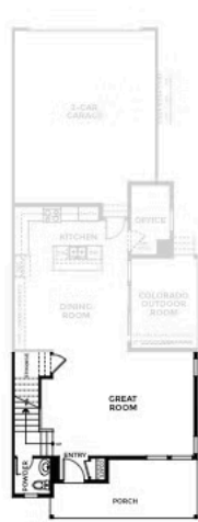
FIRST FLOOR - HIGH COUNTRY RANCH