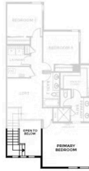
SECOND FLOOR - HIGH COUNTRY RANCH

Preliminary and subject to change. 720.802.6221 | SterlingRanchSales@trumarkco.com | 7046 Watercress Drive, Littleton CO | VIP-STERLINGRANCH.COM TRUMARKHOMES All information is for reference only. Prices, rates and specifications subject to change and should be verified by all potential homebuyers. This is not an offer to sell but is intended for information only. The developer reserves the right to make modifications in materials, specifications, plans, pricing, various fees, designs, scheduling and delivery of homes without prior notice. All dimensions and square footages are approximate. Plan and dimensions may contain minor variations from floor to floor. Updated 05/30/2024. ©