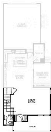
FIRST FLOOR - HIGH COUNTRY RANCH