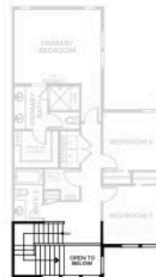
SECOND FLOOR - HIGH COUNTRY RANCH

Preliminary and subject to change. 720.802.6221 | SterlingRanchSales@trumarkco.com | 7046 Watercress Drive, Littleton CO | VIP-STERLINGRANCH.COM