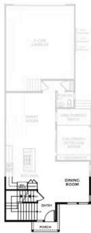
FIRST FLOOR - HIGH COUNTRY RANCH