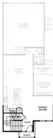
FIRST FLOOR - HIGH COUNTRY RANCH