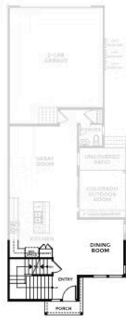
FIRST FLOOR - HIGH COUNTRY RANCH