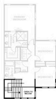
SECOND FLOOR - HIGH COUNTRY RANCH

Preliminary and subject to change. 720.802.6221 | SterlingRanchSales@trumarkco.com | 7046 Watercress Drive, Littleton CO | VIP-STERLINGRANCH.COM