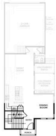
FIRST FLOOR - HIGH COUNTRY RANCH