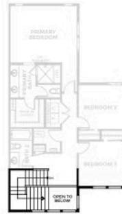
SECOND FLOOR - HIGH COUNTRY RANCH

Preliminary and subject to change. 720.802.6221 | SterlingRanchSales@trumarkco.com | 7046 Watercress Drive, Littleton CO | VIP-STERLINGRANCH.COM