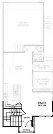
FIRST FLOOR - HIGH COUNTRY RANCH