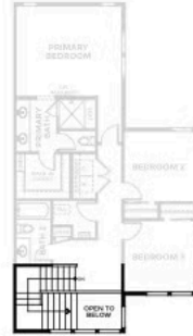
SECOND FLOOR - HIGH COUNTRY RANCH

Preliminary and subject to change. 720.802.6221 | SterlingRanchSales@trumarkco.com | 7046 Watercress Drive, Littleton CO | VIP-STERLINGRANCH.COM