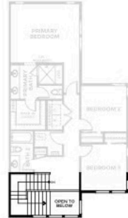
SECOND FLOOR - HIGH COUNTRY RANCH

Preliminary and subject to change. 720.802.6221 | SterlingRanchSales@trumarkco.com | 7046 Watercress Drive, Littleton CO | VIP-STERLINGRANCH.COM