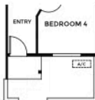
FIRST FLOOR RATIO LOW WALL (BUILDINGS 2, 3, AND 4)