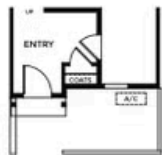
FIRST FLOOR RATIO LOW WALL (BUILDINGS 2, 3, AND 4)