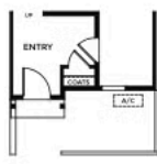
FIRST FLOOR RATIO LOW WALL (BUILDINGS 2, 3, AND 4)