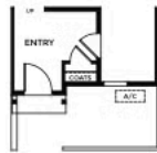
FIRST FLOOR PATIO LOW WALL (BUILDINGS 2, 3, AND 4)