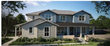
4C — COASTAL FARMHOUSE