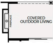
Optional Fireplace at Outdoor Living