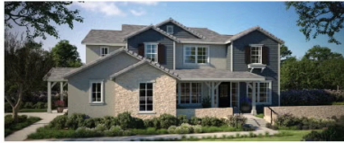
4B — FARMHOUSE