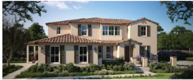
4A — SANTA BARBARA