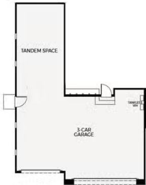
Optional 3-Car Garage with Tandem Space