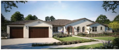
2A — SANTA BARBARA