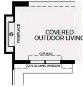
Optional Fireplace at Outdoor Living