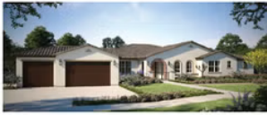
2A — SANTA BARBARA