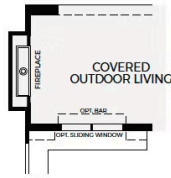
Optional Fireplace at Outdoor Living