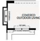
Optional Fireplace at Outdoor Living