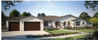
2A — SANTA BARBARA