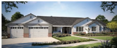
2B — FARMHOUSE