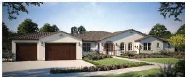
2A — SANTA BARBARA