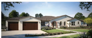
2A — SANTA BARBARA