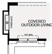
Optional Fireplace at Outdoor Living