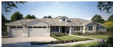
2C — COASTAL FARMHOUSE