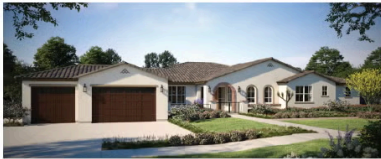
2A — SANTA BARBARA