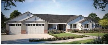
2B — FARMHOUSE