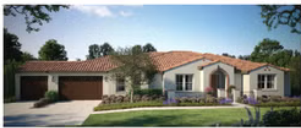
1A — SANTA BARBARA