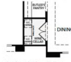
Optional Wine Cellar at Dining