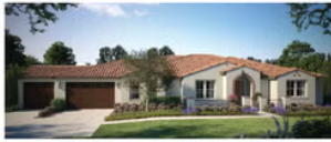
IA — SANTA BARBARA