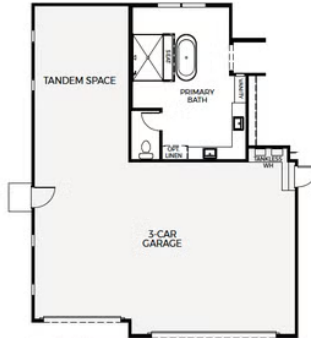
Optional 3-Car Garage with Tandem Space