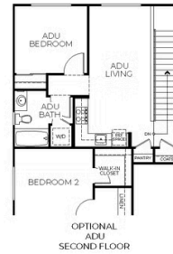
OPTIONAL ADU SECOND FLOOR