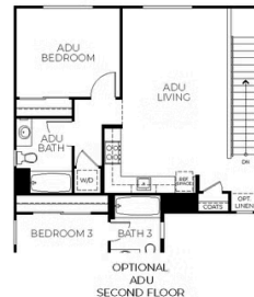
OPTIONAL ADU SECOND FLOOR

Trumark Homes reserves the right to make modifications or changes to materials, specifications, brand names, features, plans, pricing, various fees, designs, scheduling and delivery of homes without prior notice. It also reserves the right to accept or reject offers at its sole discretion, to accept a limited number of offers on non-owner-occupied residences and to sell any residence to any party at any time. Plans shown may vary from home as it is constructed. Dimensions stated are estimates. Actual dimensions may vary from floor to floor and from home to home based on site conditions and other factors. Plans and dimensions may contain minor variations from floor to floor. Models do not display racial preference. Homes shown may not represent actual homesites. This is not an offer to sell but is intended for information only. CA DSE license #0387720.