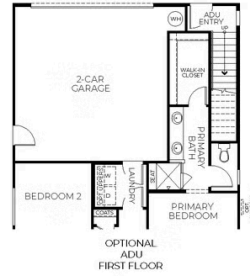
OPTIONAL ADU FIRST FLOOR