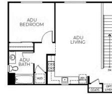
OPTIONAL ADU SECOND FLOOR